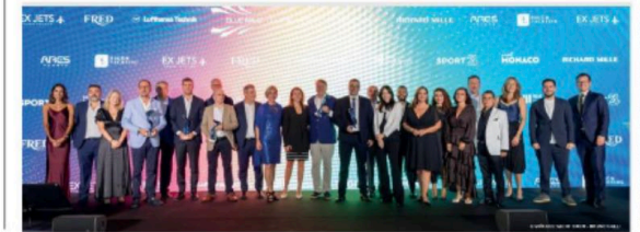
PHOTOGRAPHY: MONACO YACHT SHOW